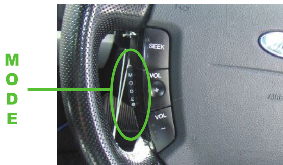
FORD FALCON BA