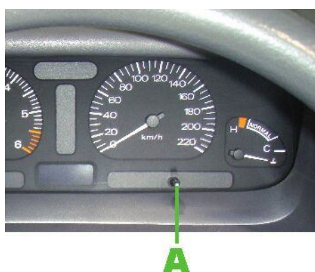
FORD FALCON EF

Note: Trip meter button locations may vary between models.