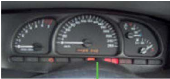
HOLDEN JS VECTRA 1999