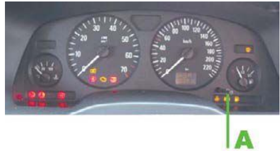
HOLDEN ZAFIRA 2004