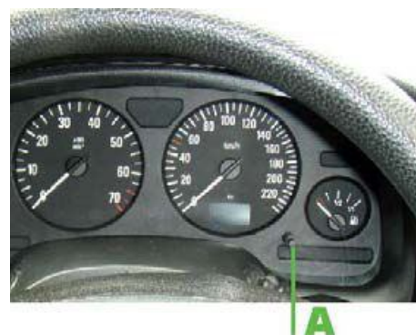
HOLDEN ASTRA TS 2005