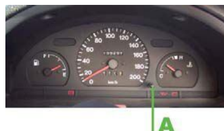
HOLDEN BARINA MH 1993